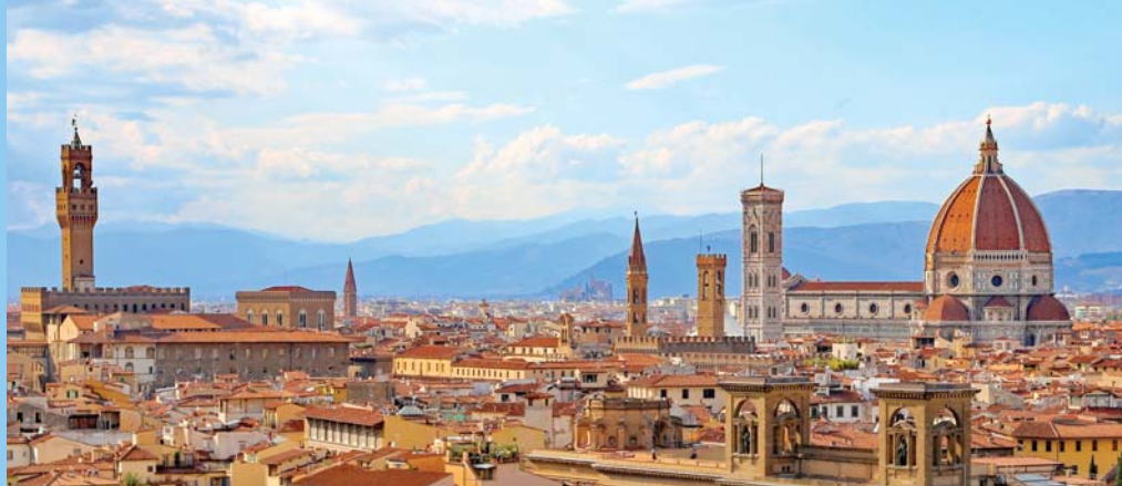
The distinctive early-14 th -century tower of the Palazzo Vecchio and Filippo Brunelleschi's magnificent 15 th -century dome are consummate symbols of Florence and the Renaissance.