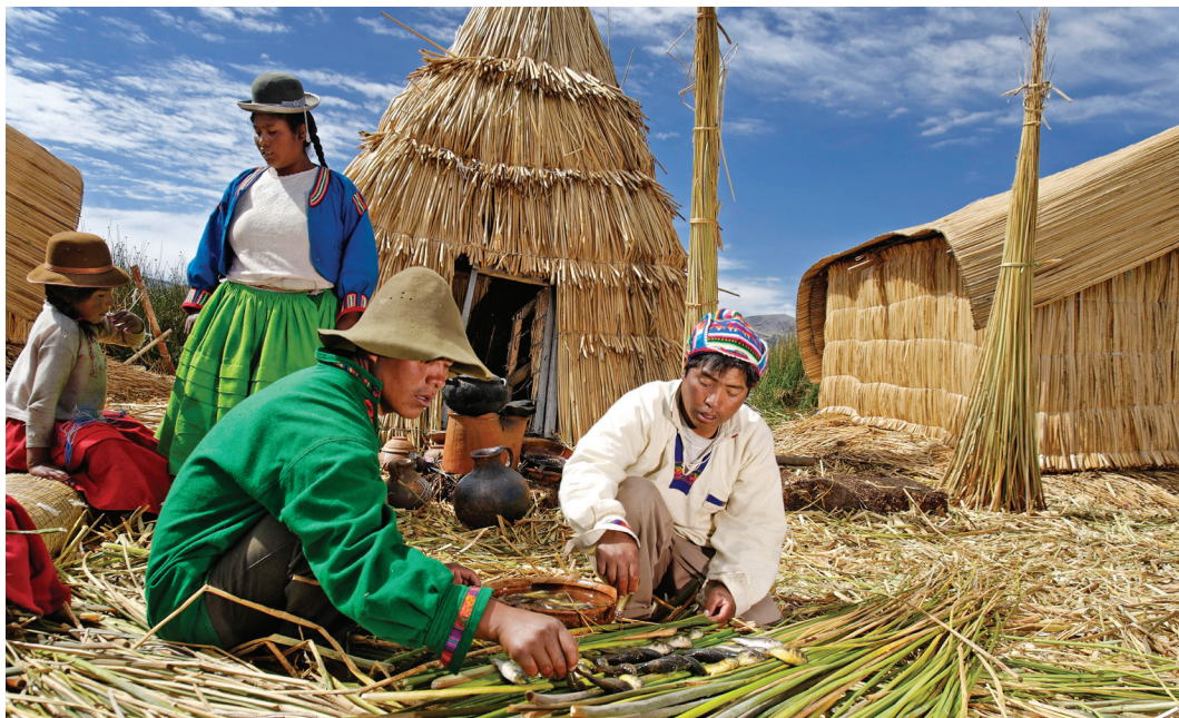
Uros Island residents weaving reeds in the traditional manner

our first guided visit of the stunning “Lost City of the Incas.” Thanks to its small size, our group will move nimbly through the ruins and have the leisure to absorb the beauty and mystery of this haunting UNESCO World Heritage site. Mid-afternoon we return to Aguas Calientes and our hotel, with time at leisure before dinner together tonight. B,L,D