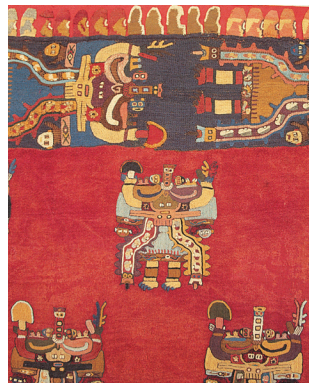
Traditional Peruvian fabric

lakes. Up here the air is clearer, the colors sharper, and the horizon farther. By boat we visit the Floating Islands of Los Uros, where the top-hatted Uros people live on "islands" made of the reeds that grow in the lake's shallows; in fact, the Uros rely on these reeds for their boats, the small huts in which they live, household items, and the handicrafts they sell to visitors.