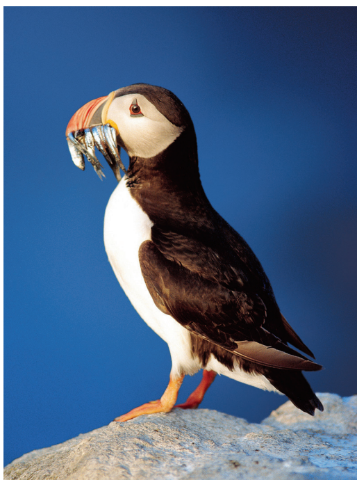
Hardy puffins thrive in Iceland.

where the fissure between the geological plates of North America and Europe is most evident. It’s also a gem of nature, with canyons, caves, waterfalls, and ponds surrounded by snow-capped mountains. We learn about the historic parliament founded here in 930 CE, and walk along a gorge into the rift valley itself. After a lunch of wild freshwater trout at a lakeside hotel, we depart for famed Great Geysir and Gullfoss, Iceland’s immensely popular “golden” waterfall. Then we drive down to the southern coast to the beautiful agricultural area of Selfoss. B,L