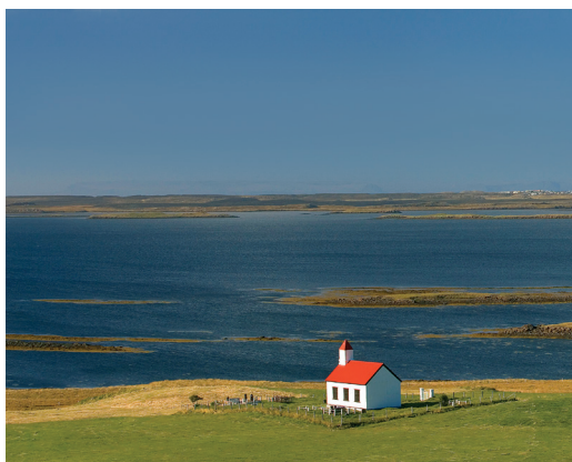
Iceland has a desolate beauty.