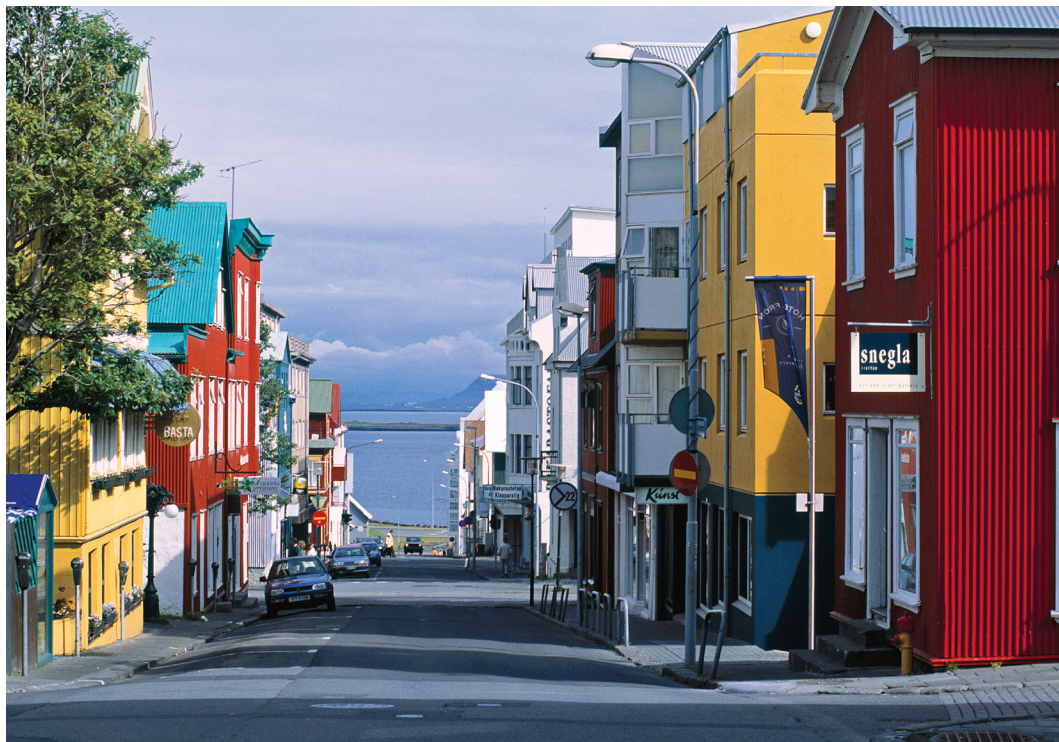
Colorful buildings line Reykjavik's streets.

lunar-like volcanic craters comprise a stunningly beautiful national park. Our explorations begin with a stop at Godafoss, the “waterfall of the gods” named for the carvings of Norse gods discarded here when the country was declared Christian a thousand years ago. We continue with a walk up to the fascinating Hverfjall crater, a local landmark. Later we see the region’s unique “pseudo craters,” the boiling mud pots at Namaskard, the bizarre lava formations at Dimmuborgir, the explosive crater at Viti, and the flat volcano system at Krafla. Our last stop is the incredible “Glacial River Canyon” National Park, yet another of Iceland’s natural wonders, where we walk to jaw-dropping Dettifoss, Europe’s most powerful waterfall and Iceland’s “Niagara.” After this day of stunning scenery, we return to our hotel in time for dinner on our own tonight. B