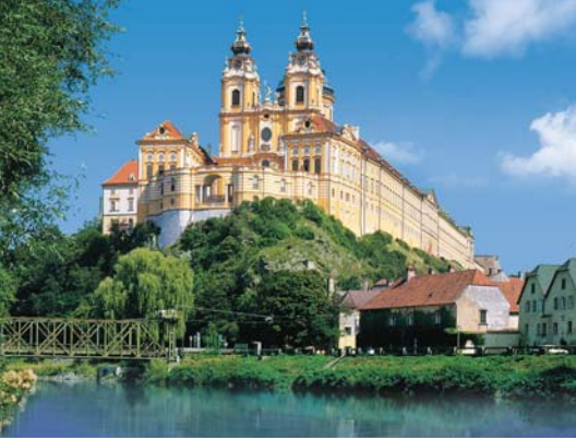
Founded in 1089, the Austrian Benedictine Abbey of Melk houses a world-renowned monastic library.

RESPONSIBILITY: Thomas P. Gohagan & Company, The President and Trustees of Williams College, and its and their employees, shareholders, subsidiaries, affiliates, officers, directors or trustees, successors, and assigns (collectively “Gohagan”), do not own or operate any entity which is to or does provide goods or services for your trip including, for example, lodging facilities, airline, vessel, or other transportation companies, guides or guide services, local ground operators, providers or organizers of optional excursions, food service or entertainment providers, etc. All such persons and entities are independent contractors. As a result, Gohagan is not liable for any negligent or willful act or failure to act of any such person or entity or of any other third party.