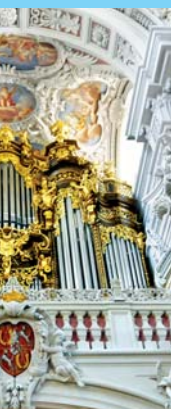
Soft tones of the pipe organ in St. Stephen's Cathedral provide a welcome respite to humans.

stunning 18 th -century ceiling frescoes by Paul Troger. In Melk Abbey's beautiful kirche (church), admire the perfectly intact multi-panel 16 th -century altarpiece by Danube School master