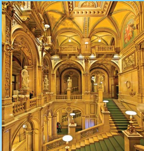
The original opulence of the 19 th -century Vienna State Opera is preserved in its central staircase and foyer.

Palace and Gardens, the spectacular summer estate of the imperial Habsburgs. It was here, in one of the grand salons decorated in a priceless collection of art and antiques, that a six-year-old Mozart first performed for Empress Maria Theresa and her daughter, the future Queen of France, Marie Antoinette.