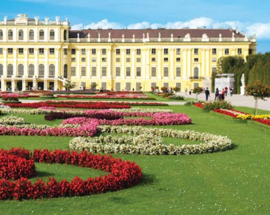
Palace, a UNESCO World Heritage site and summer residence of Emperor Franz Josef.