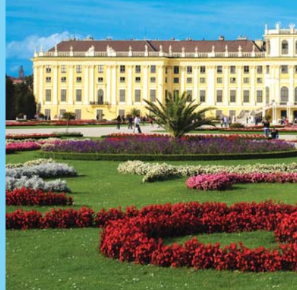
Admire the Rococo grandeur of Schönbrunn Palace, the summer residence of Habsburg royalty from Marie Antoinette.

stunning 18 th -century ceiling frescoes by Paul Troger. In Melk Abbey's beautiful kirche (church), admire the perfectly intact multi-panel 16 th -century altarpiece by Danube School master