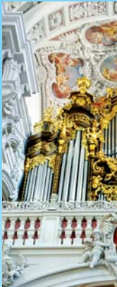
The highest and low organ in Passau’s St. are nearly inaudible

Travel across rolling hills and through the bucolic wooded Czech and German countryside to Passau, where three legendary rivers—the Danube, Ilz and Inn—converge. Enjoy lunch in a historic, traditional German restaurant before the walking tour along the cobblestone streets of Altstadt, Passau’s Old Town. Visit the Baroque-style St. Stephan’s Cathedral, consecrated in the 12 th century, where the largest pipe organ in Europe is housed.