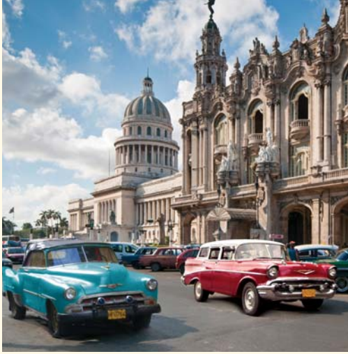
The streets of Cuba are a treasure trove of American classic cars lovingly and innovatively preserved.