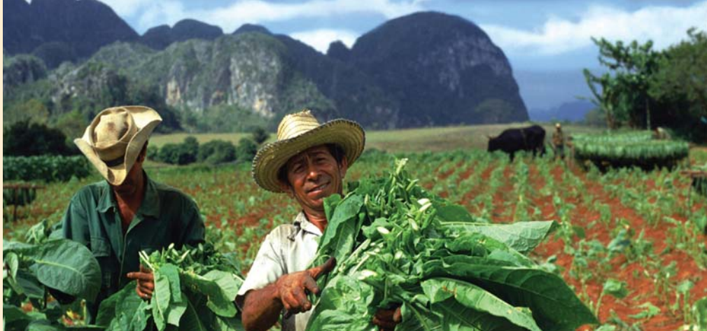
The agricultural province of Pinar del Río is home to the fertile Viñales Valley, a UNESCO World Heritage site, where farmers notably grow much of the world's premium cigar tobacco.

This evening, check into Havana's MELIÁ HABANA HOTEL.