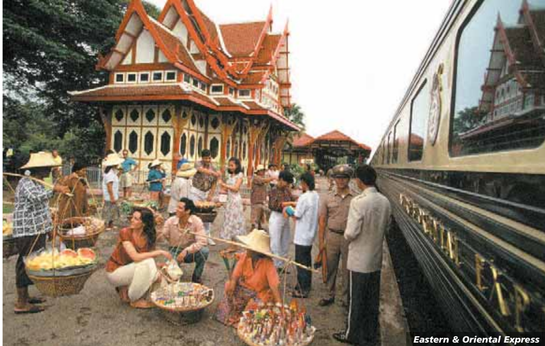
Eastern & Oriental Express