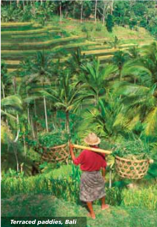
Terraced paddies, Bali