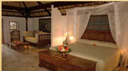
JIMBARAN PURI BALI BALI