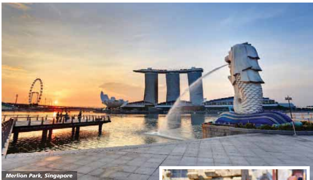
Merlion Park, Singapore