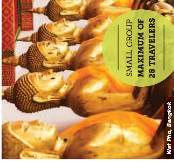
Wat Pho, Bangkok