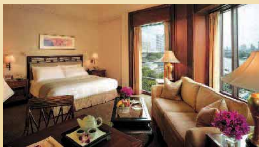
THE PENINSULA BANGKOK BANGKOK