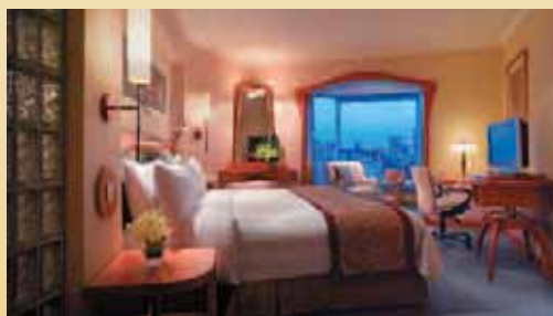
SHANGRI-LA HOTEL SINGAPORE