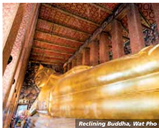
Reclining Buddha, Wat Pho