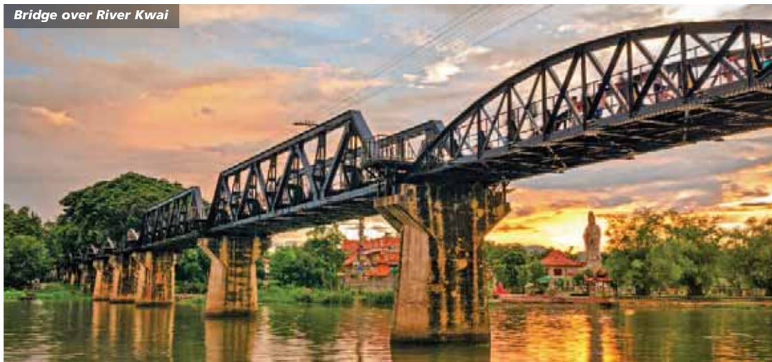
Bridge over River Kwai