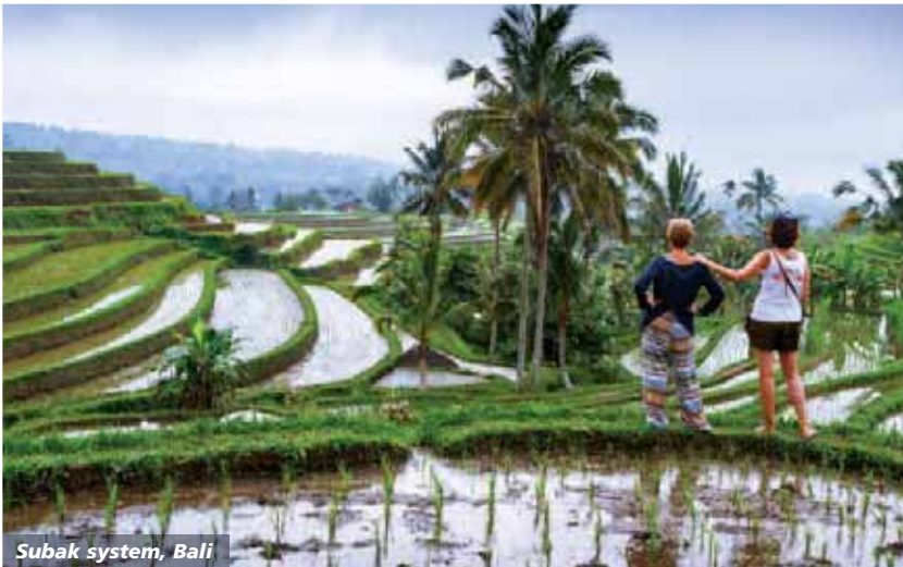
Subak system, Bali